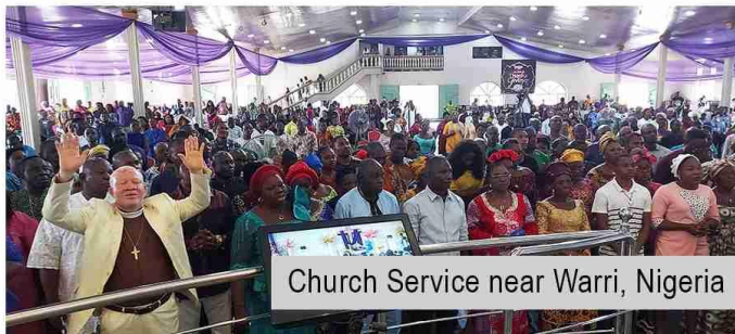
Church Service near Warri, Nigeria