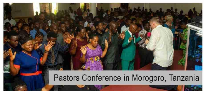
Pastors Conference in Morogoro, Tanzania