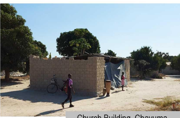
Church Building, Chavuma