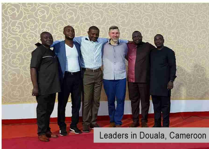
Leaders in Douala, Cameroon